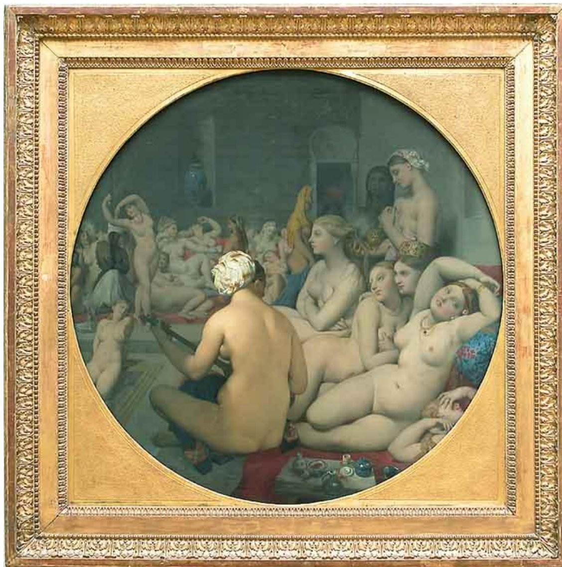
Le Bain Turc (1862) Jean-Auguste-Dominique INGRES (1780-1867) Oil on canvas 108 x 110