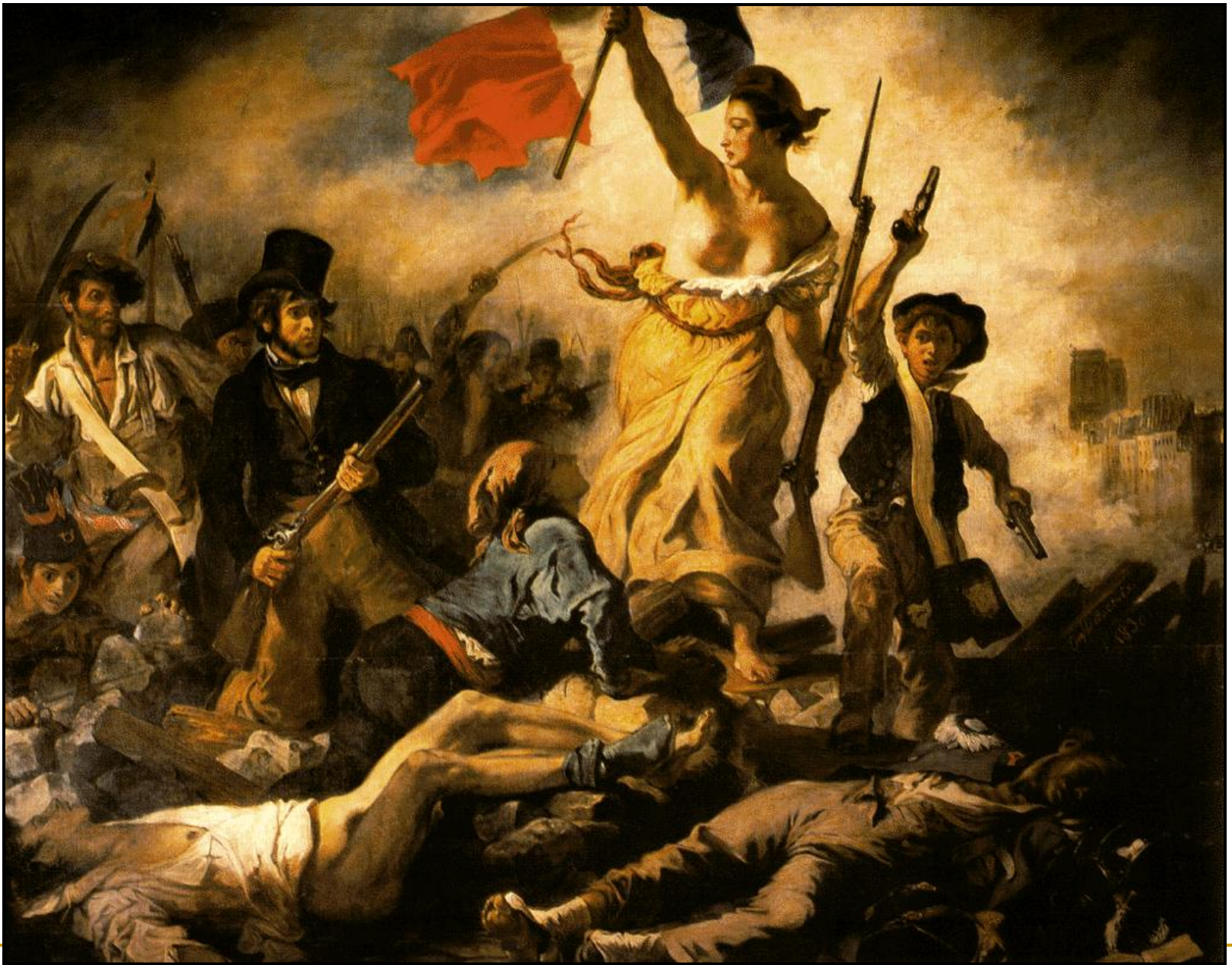
A Liberdade Guiando O Povo - Eugène Delacroix