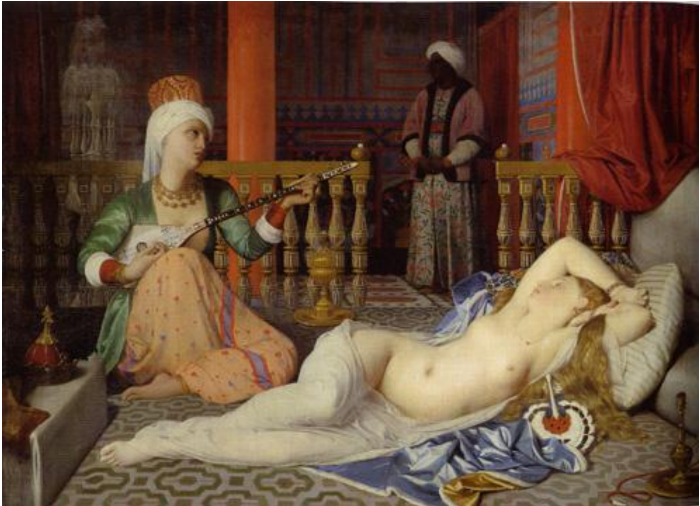
Odalisque and Slave (1839) Ingres Oil on canvas 76 x 105 cm Fogg Art Museum, Massachusetts