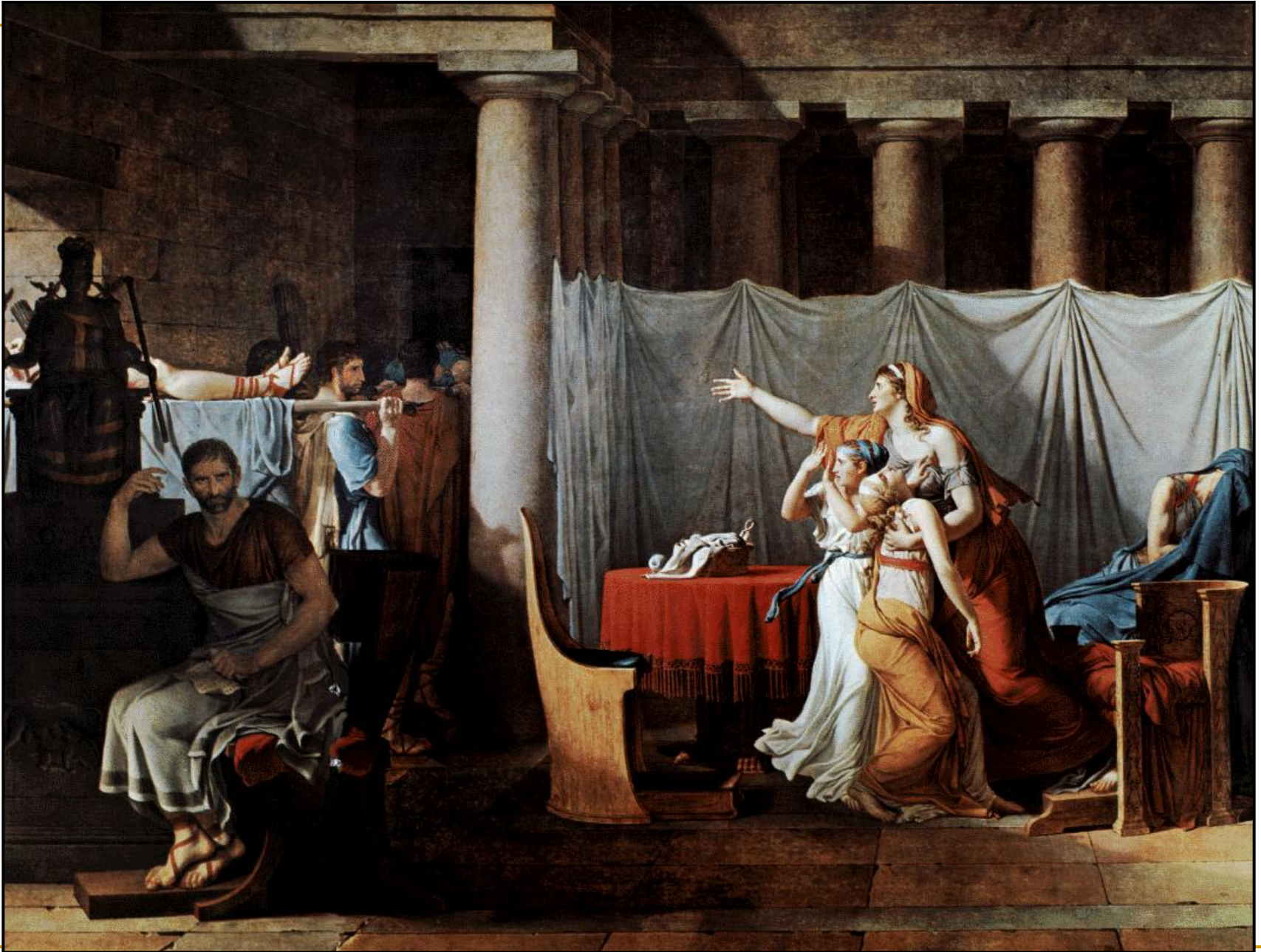
The Lictors Bring to Brutus the Bodies of His Sons (1789) oil on panel – Jacques-Louis David – 323 x 422 cm Louvre Paris