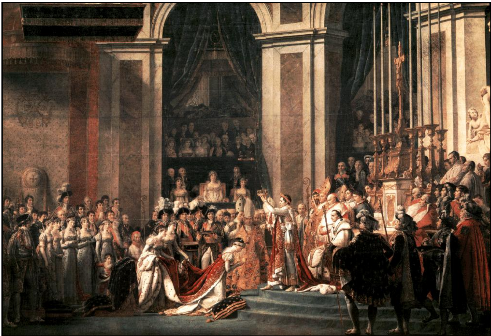
A Coroação (1805) - Jacques-Louis David . Óleo sobre tela. 610 x 931 cm Louvre