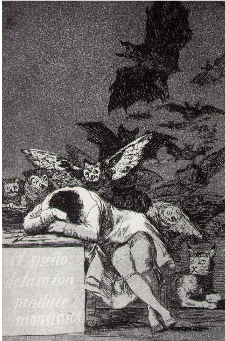
Goya. Los caprichos. Lamina 43. El sueño de la razón produce monstruos. Gravura e água -tinta, 21,5 x 15,2 x cm Prado