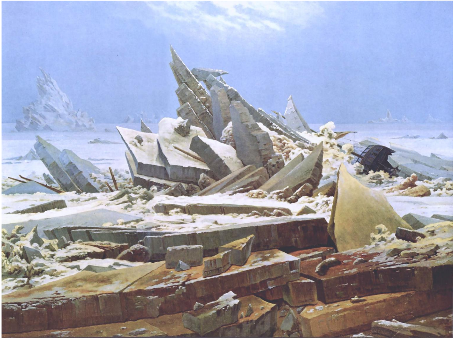
The Sea of Ice (The Wreck of Hope) - 1823 - 126.9 × 96.7 cm Caspar David Friedrich (1774-1840)