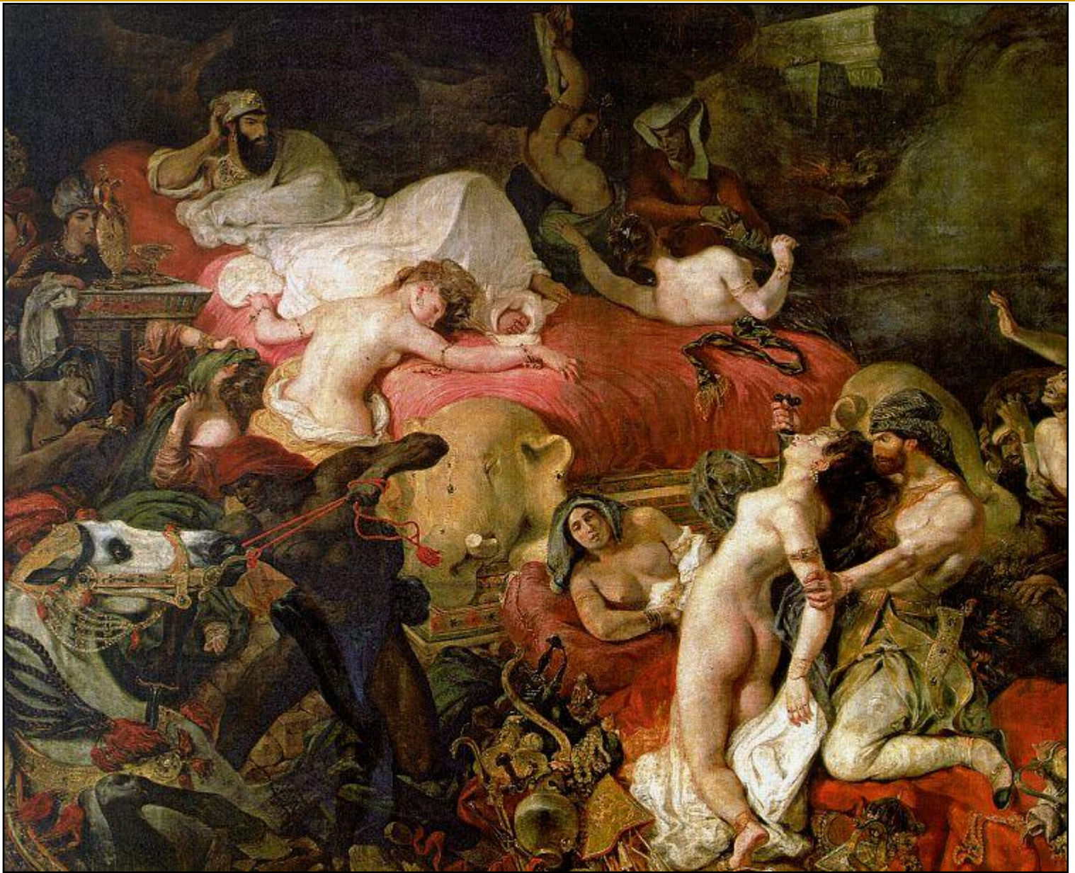
The Death of Sardanapalus 1827-28 Eugène Delacroix 395 x 495 cm Musée du Louvre, Paris