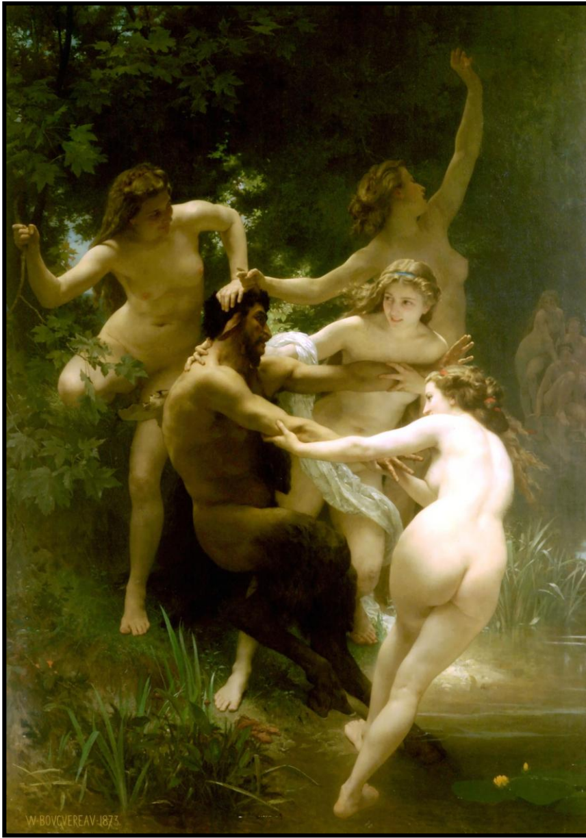
Adolphe William Bouguereau - Nymphs-and-Satyr - 1873