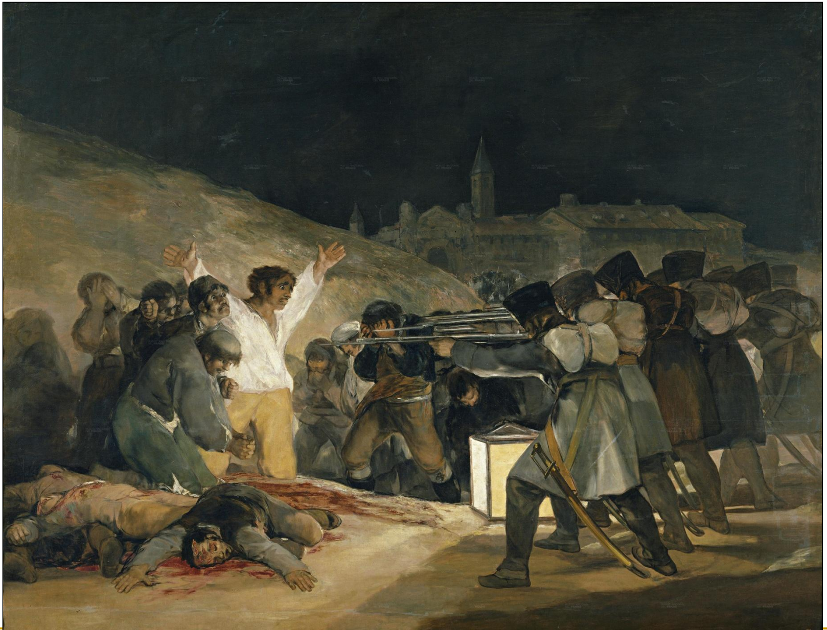
Os Fuzilamentos de 3 de Maio de 1808 - Francisco Goya Prado 268 x 347 cm