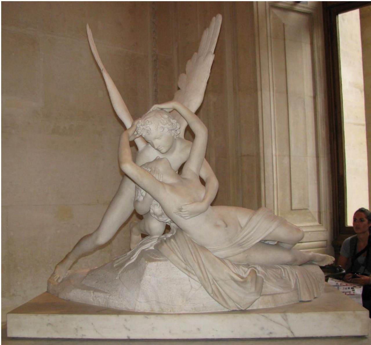
Cupido de Psique (1787) – Antonio Canova – Mármore (46 x 58 x 43 cm) Louvre Paris