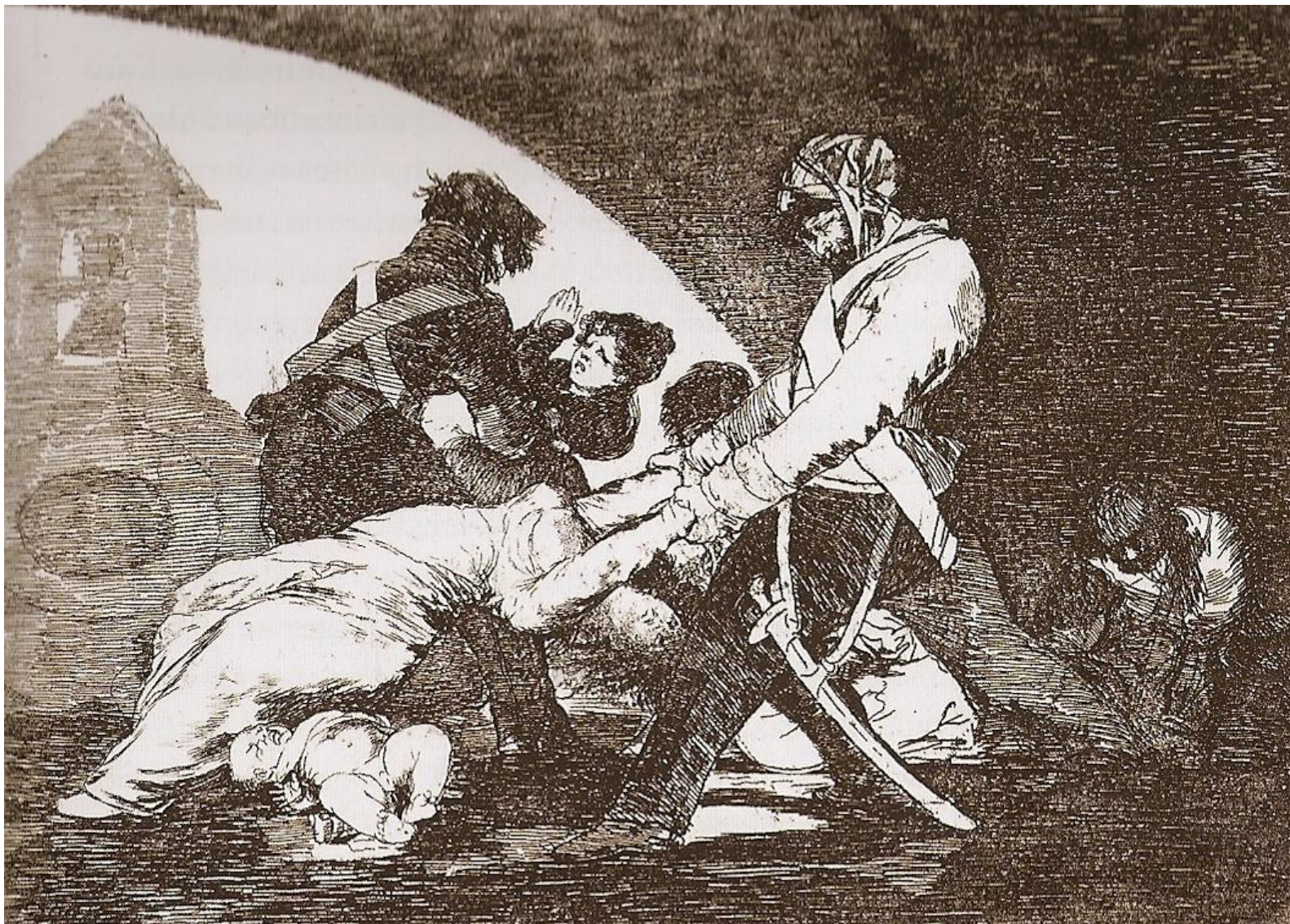
Goya. Los desastres de la guerra. Laminas 11. Ni por éstas. Gravura e água –tinta, 17,7 x 21,5 cm