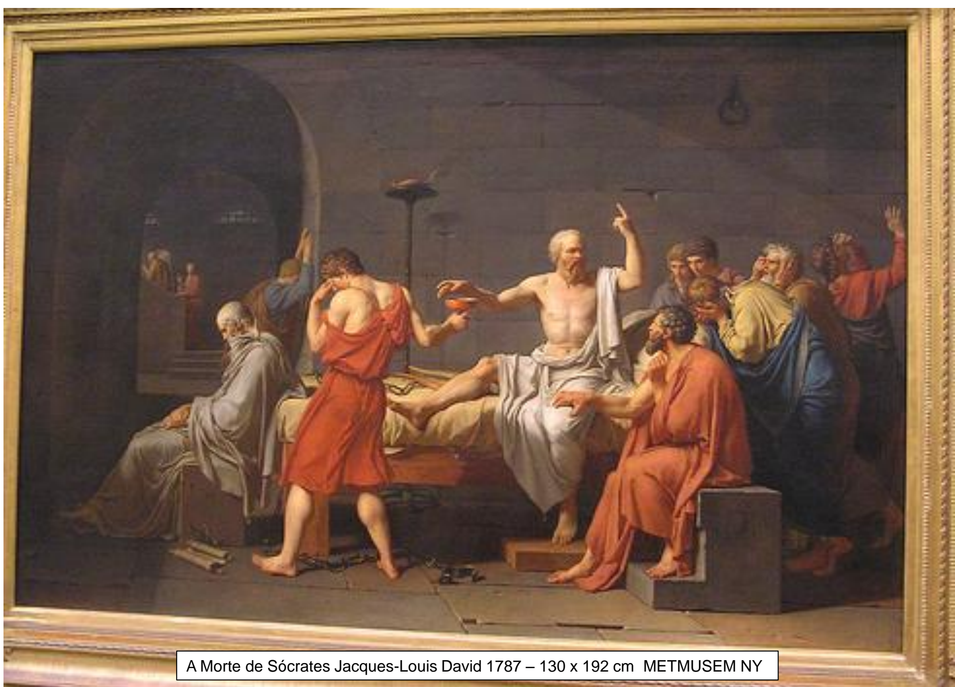
A Morte de Sócrates Jacques-Louis David 1787 – 130 x 192 cm METMUSEM NY