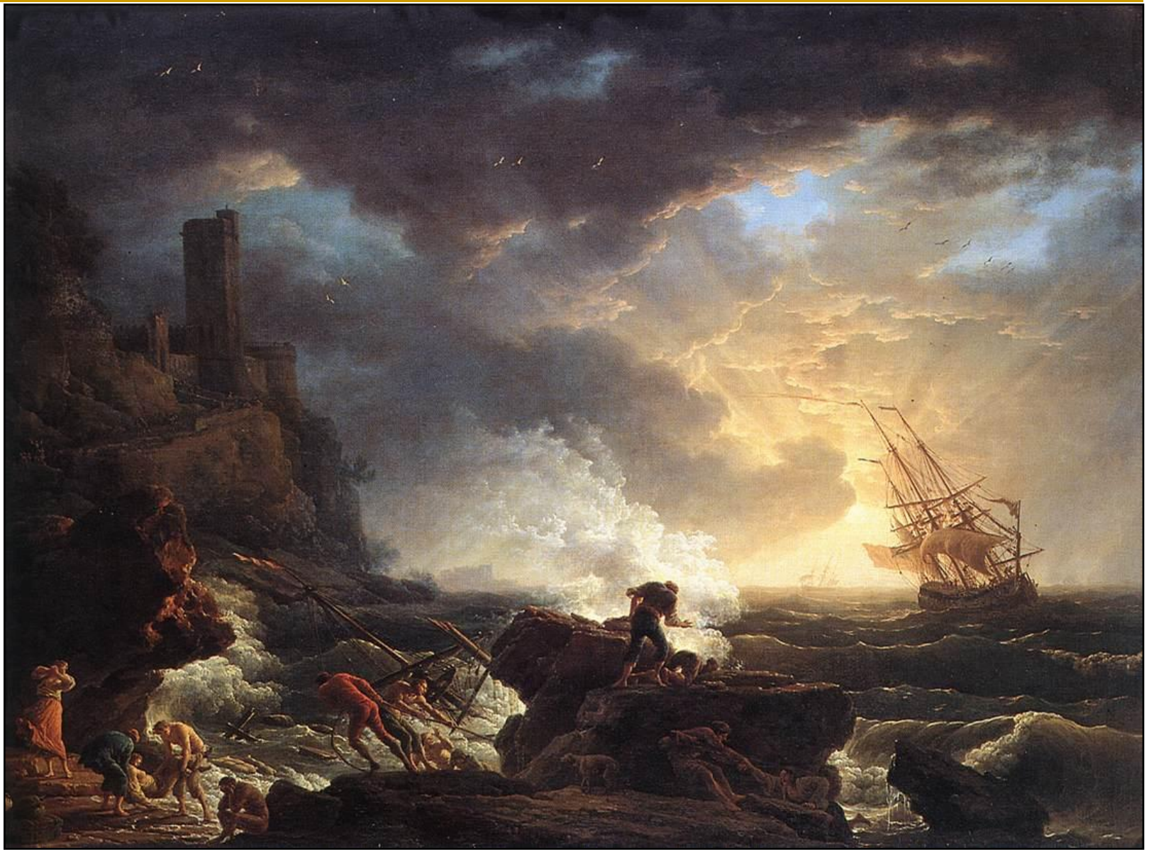
Shipwreck , 1759 , Oil on canvas, 96 x 134,5 cm , Groeninge Museum, Bruges Joseph Vernet (1714-1789)