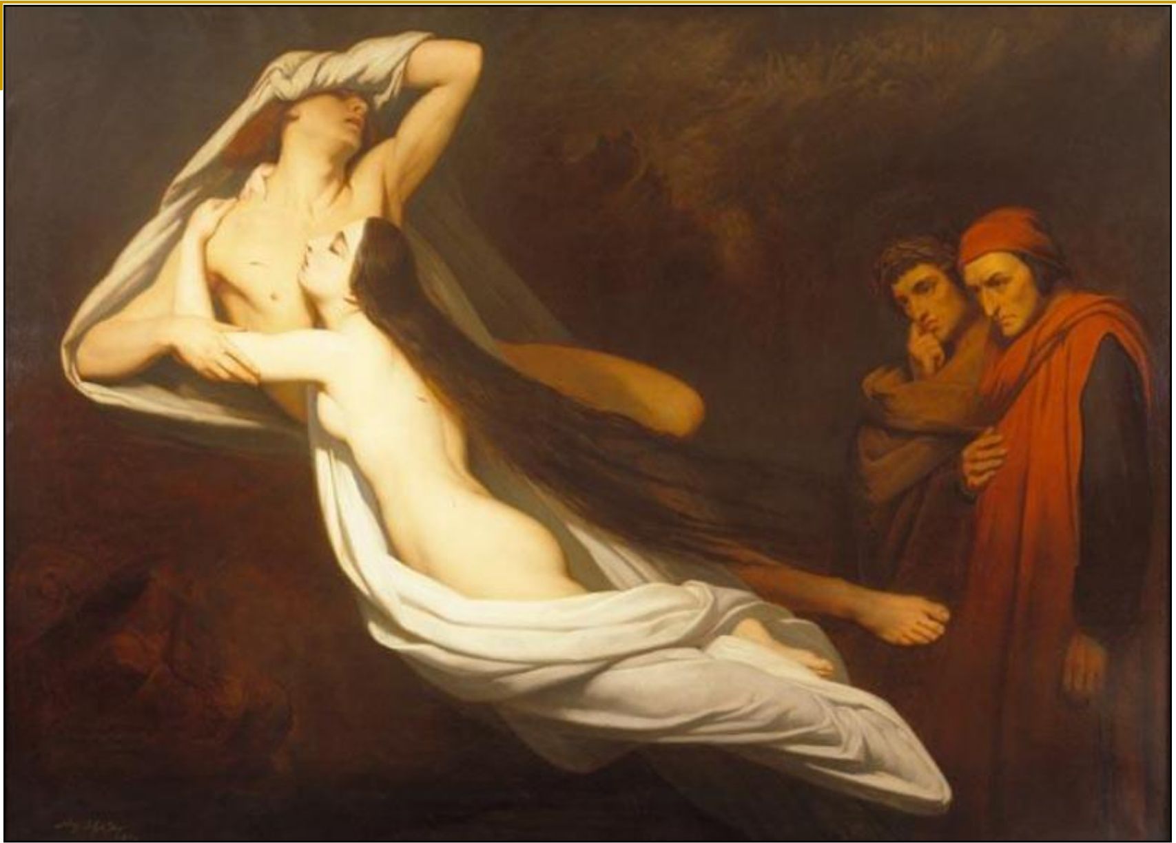
Ary Schefer - Dante and Virgil Encountering the Shades of Francesca and Paolo in the Underworld (1851) Oil on canvas (172.7 x 238.8 cm.) Cleveland Museum of Art Ohio