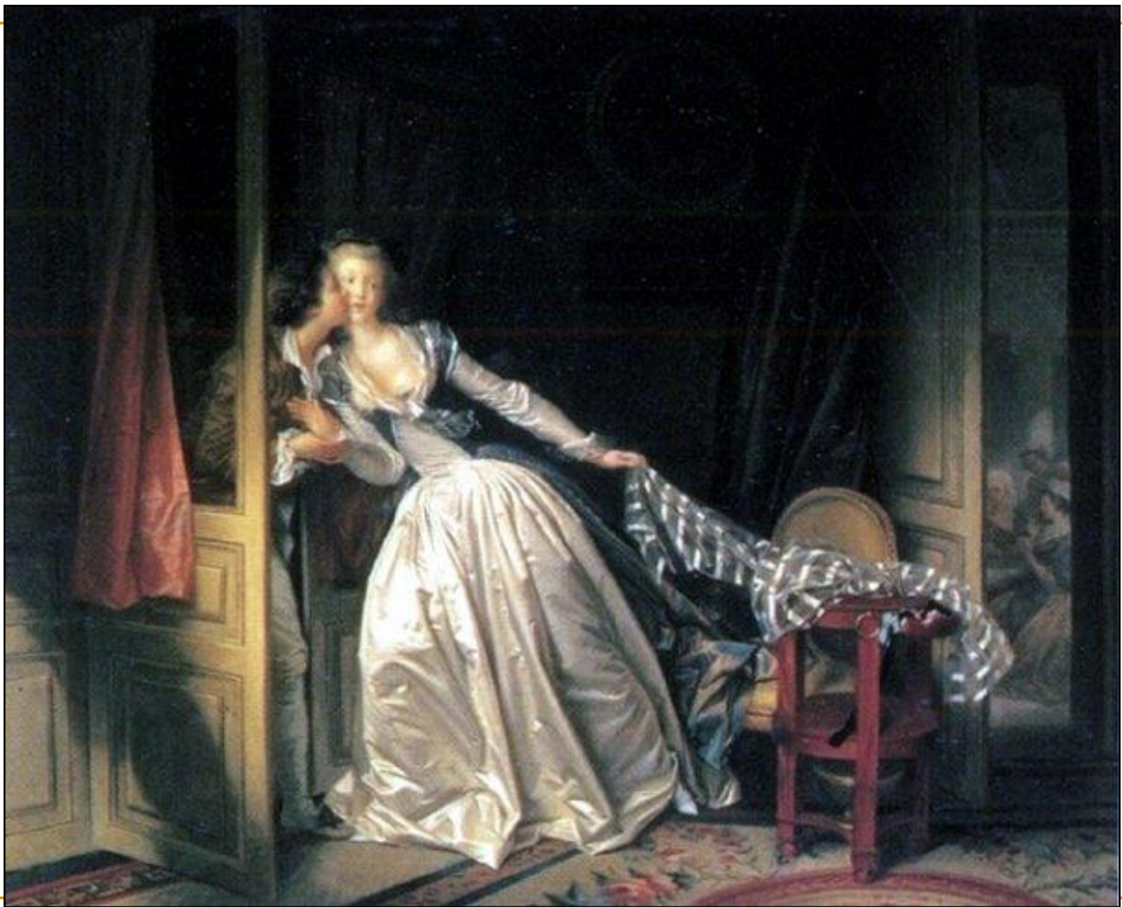
O Beijo Roubado (1787) - Jean-Honoré Fragonard – 45 x 65 óleo sobre tela – Hermitage – São Petersburgo - Rússia