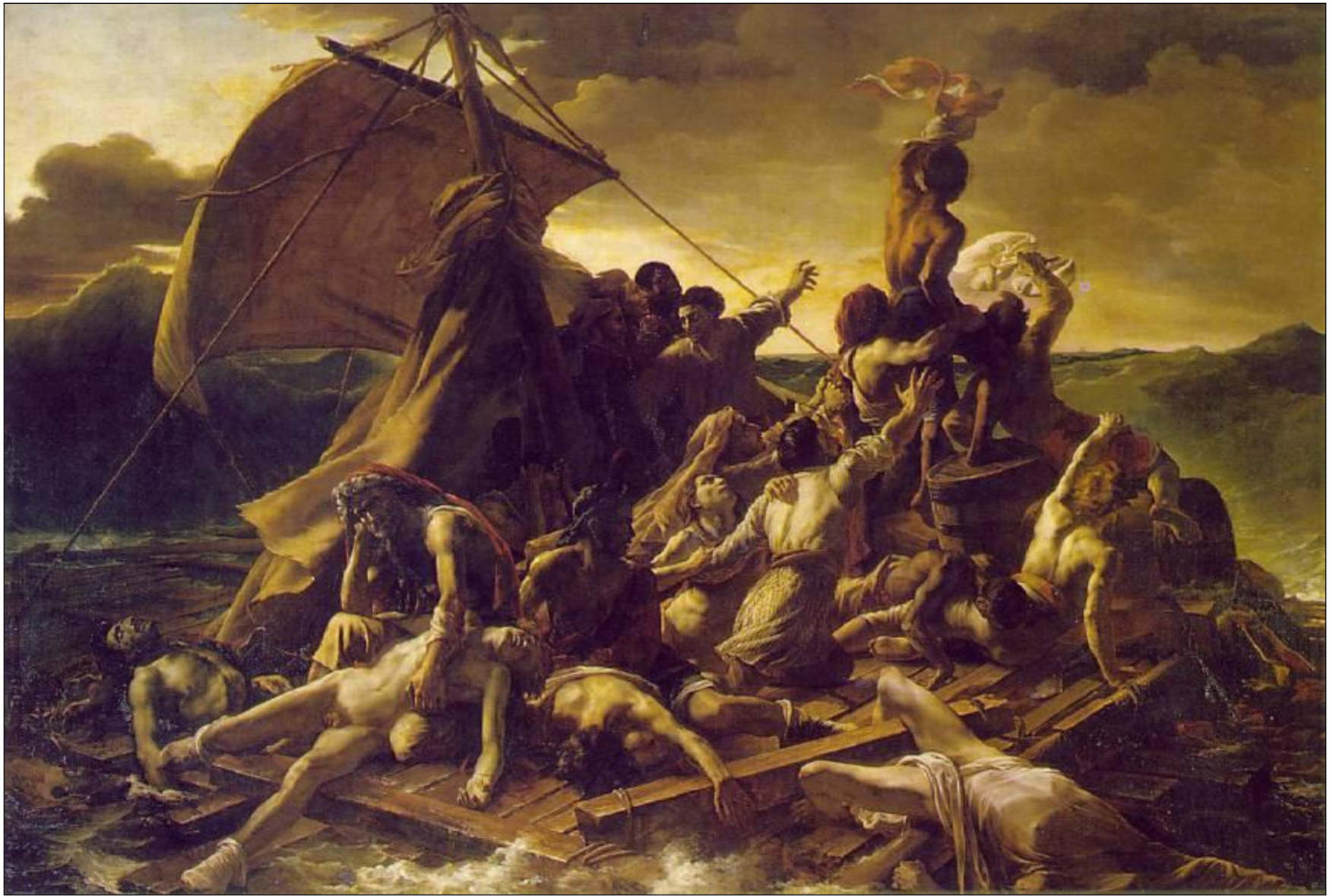
A Barca do Medusa – Gericault – 1819 – 3,7 x 6,0 m