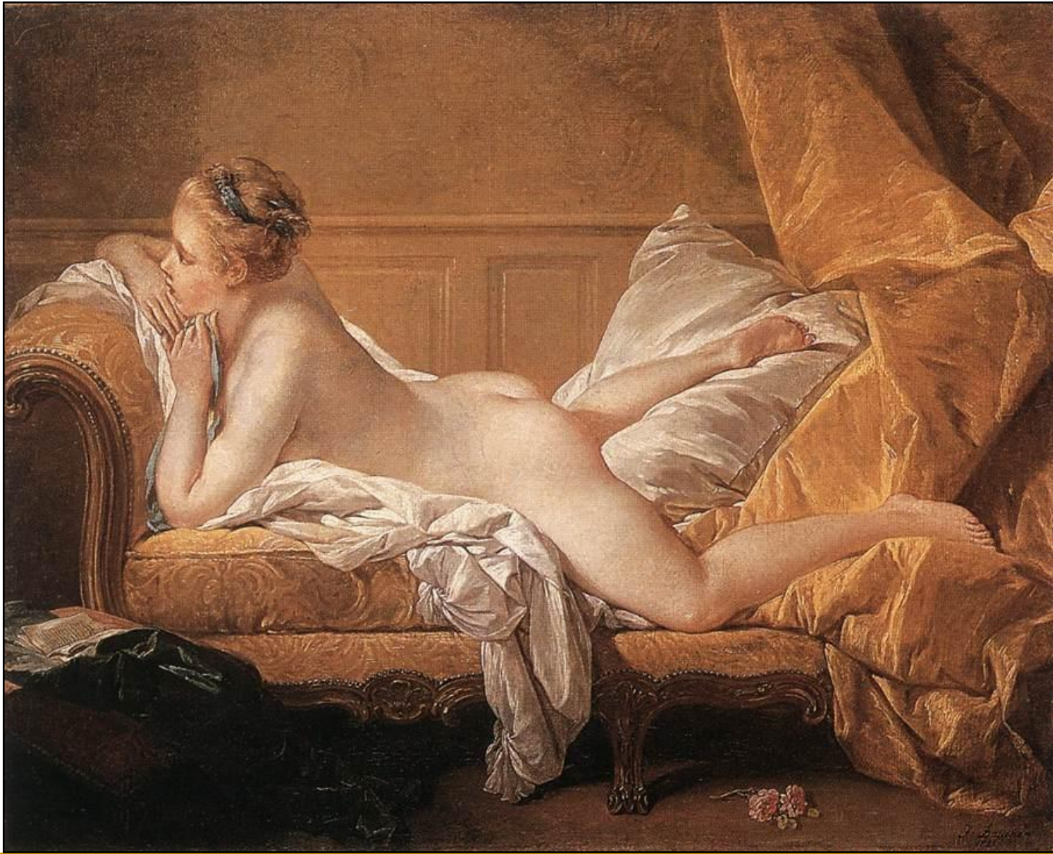
Girl Reclining (Louise O'Murphy) 1751 – François Boucher - Oil on canvas, 59,5 x 73,5 cm allraf-Richartz Museum, Cologne