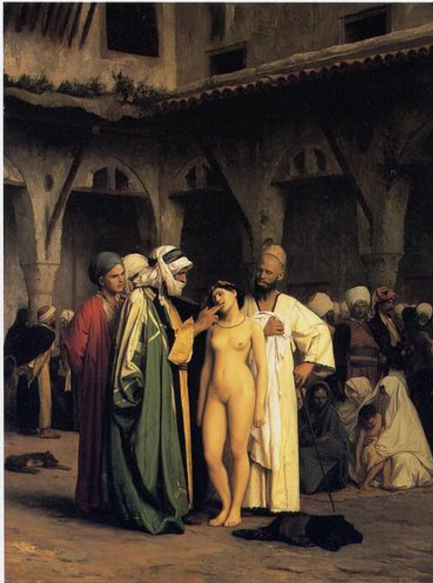
O Mercado de Escravas (1884) – Gerome - 83 x 62 cm Óleo sobre tela Sterling & Francine Clark Art Institute – Williamstown, Mass EUA