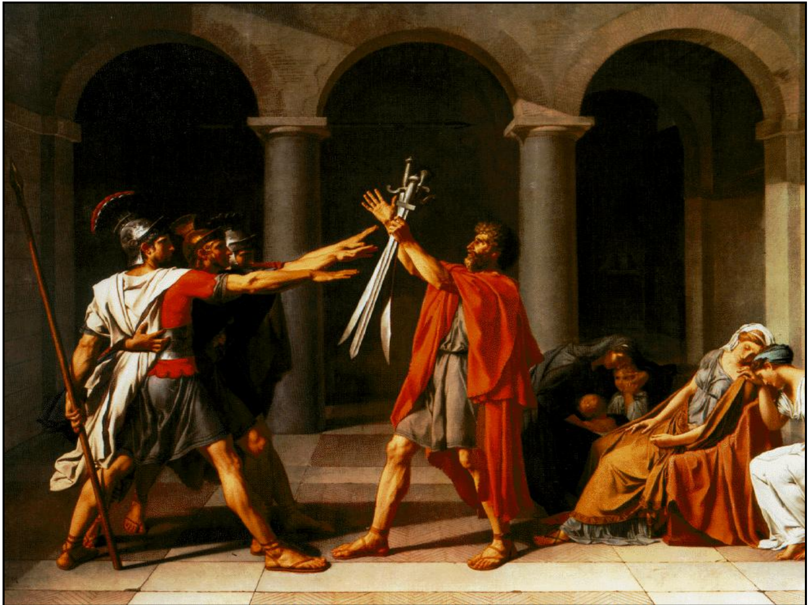
O Juramento dos Horácios Jacques-Loius David (1784) 130 x 167 cm - Louvre