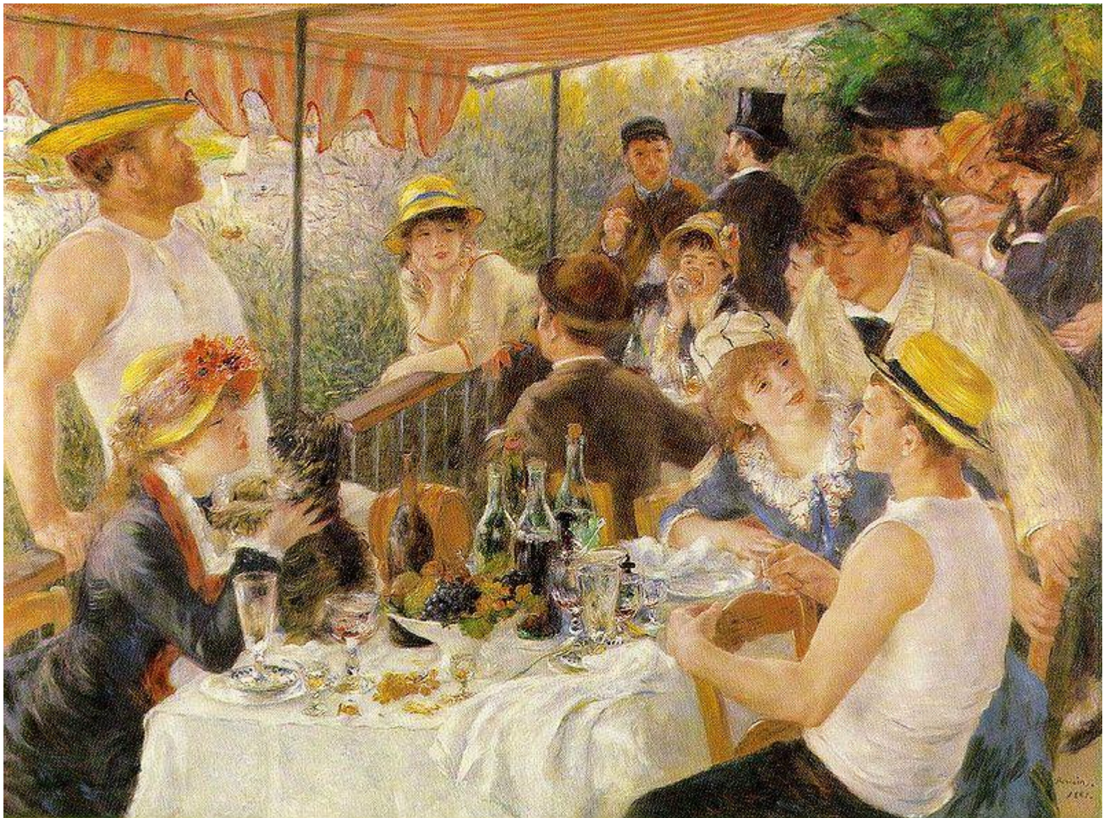
O Almoço dos Remadores - Auguste Renoir - 1880-1881, The Phillips Collection, Washington, D.C