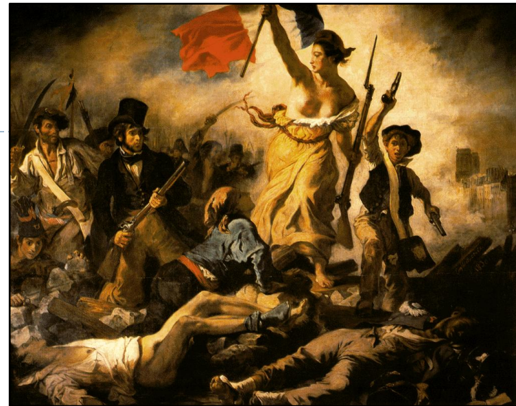
Liberdade Guiando o Povo - Eugène Delacroix