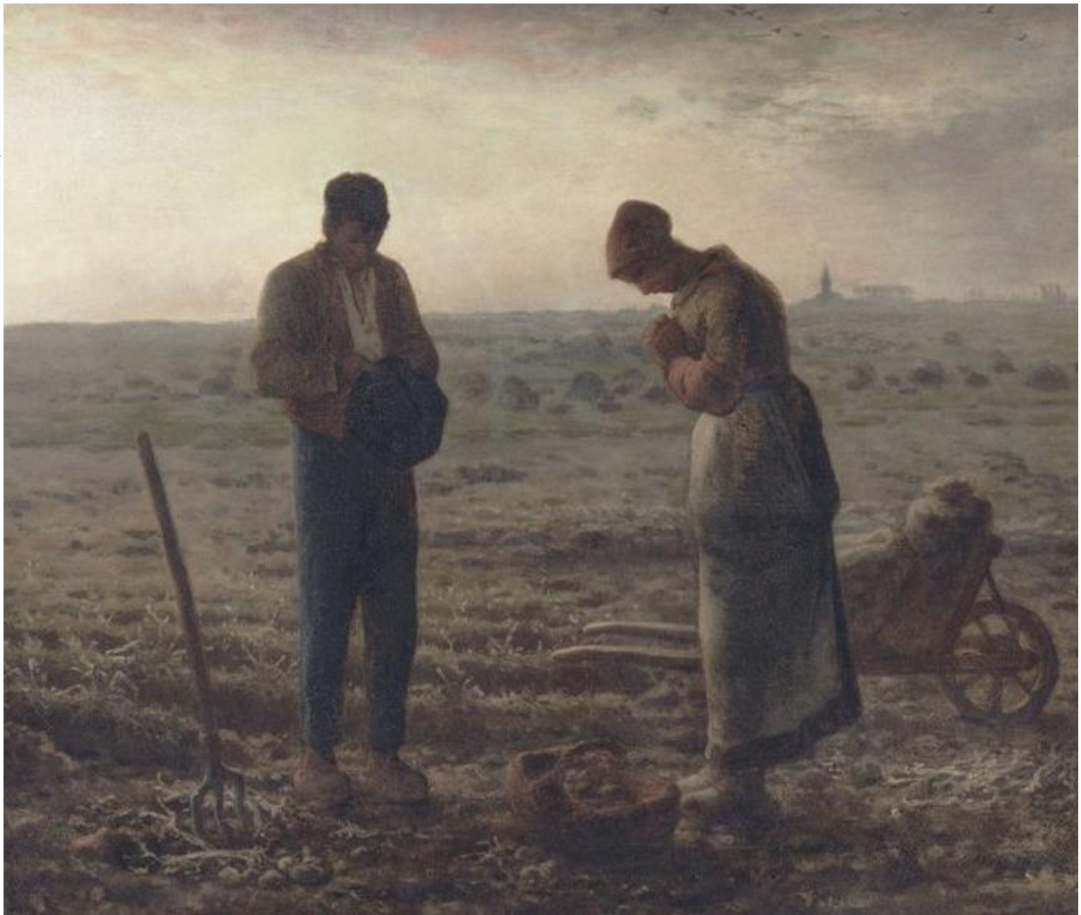
Angelus (1859) - Jean-François Millet 53 x 66 - Dorsay