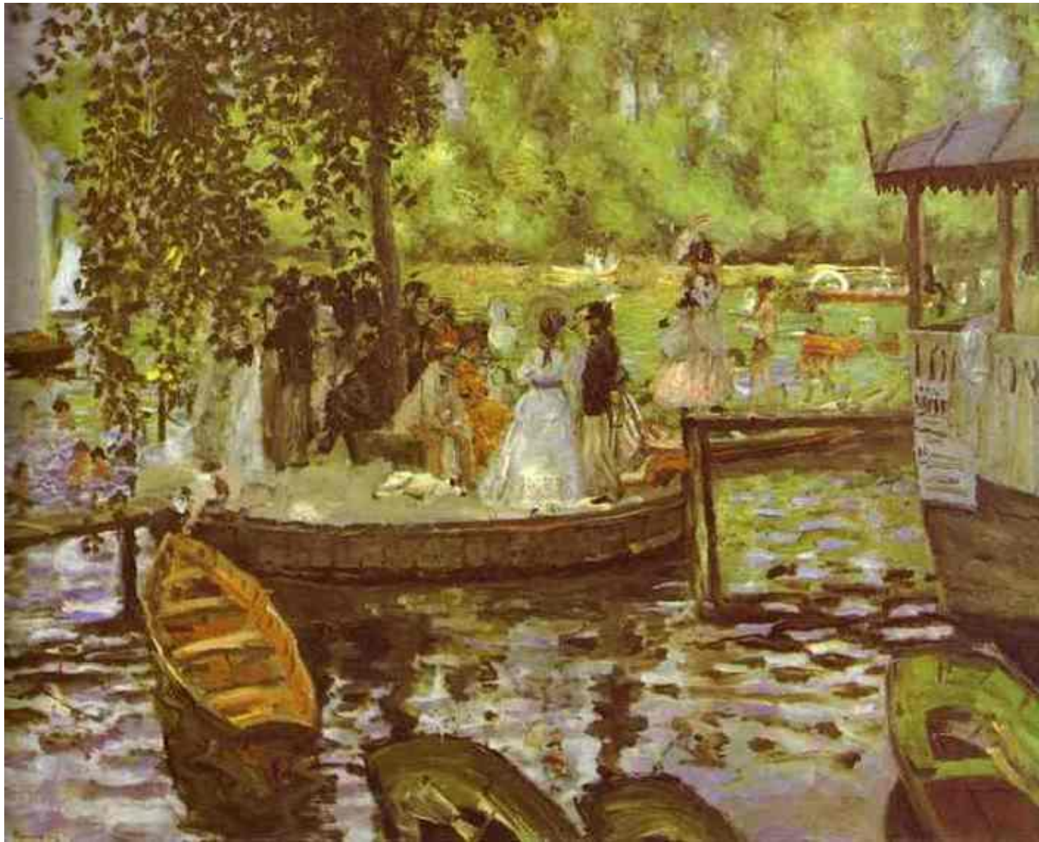
La Grenouillère, 1868, National Museum, Stockholm, Sweden