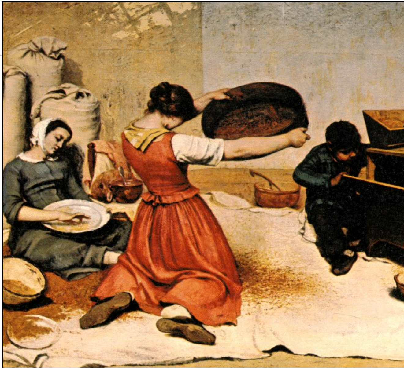
Mulheres Peneirando Trigo - Gustave Courbet