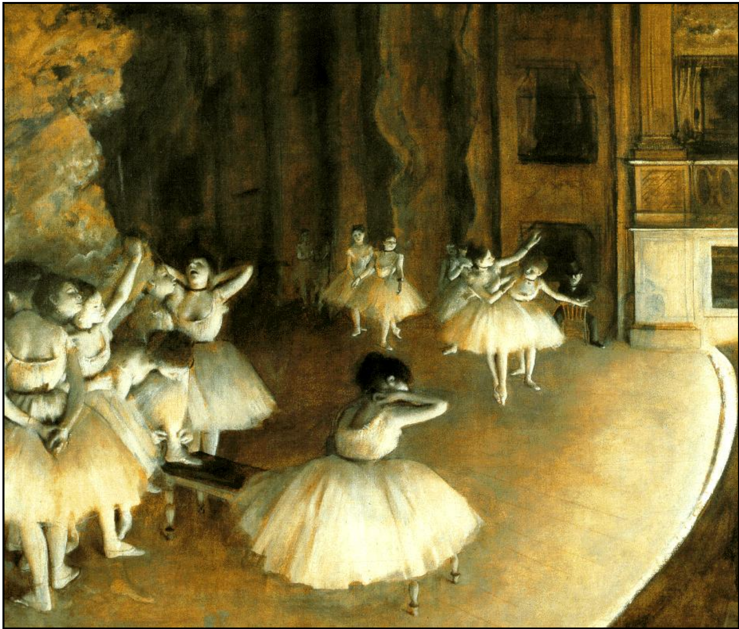
O Ensaio - Edgar Degas