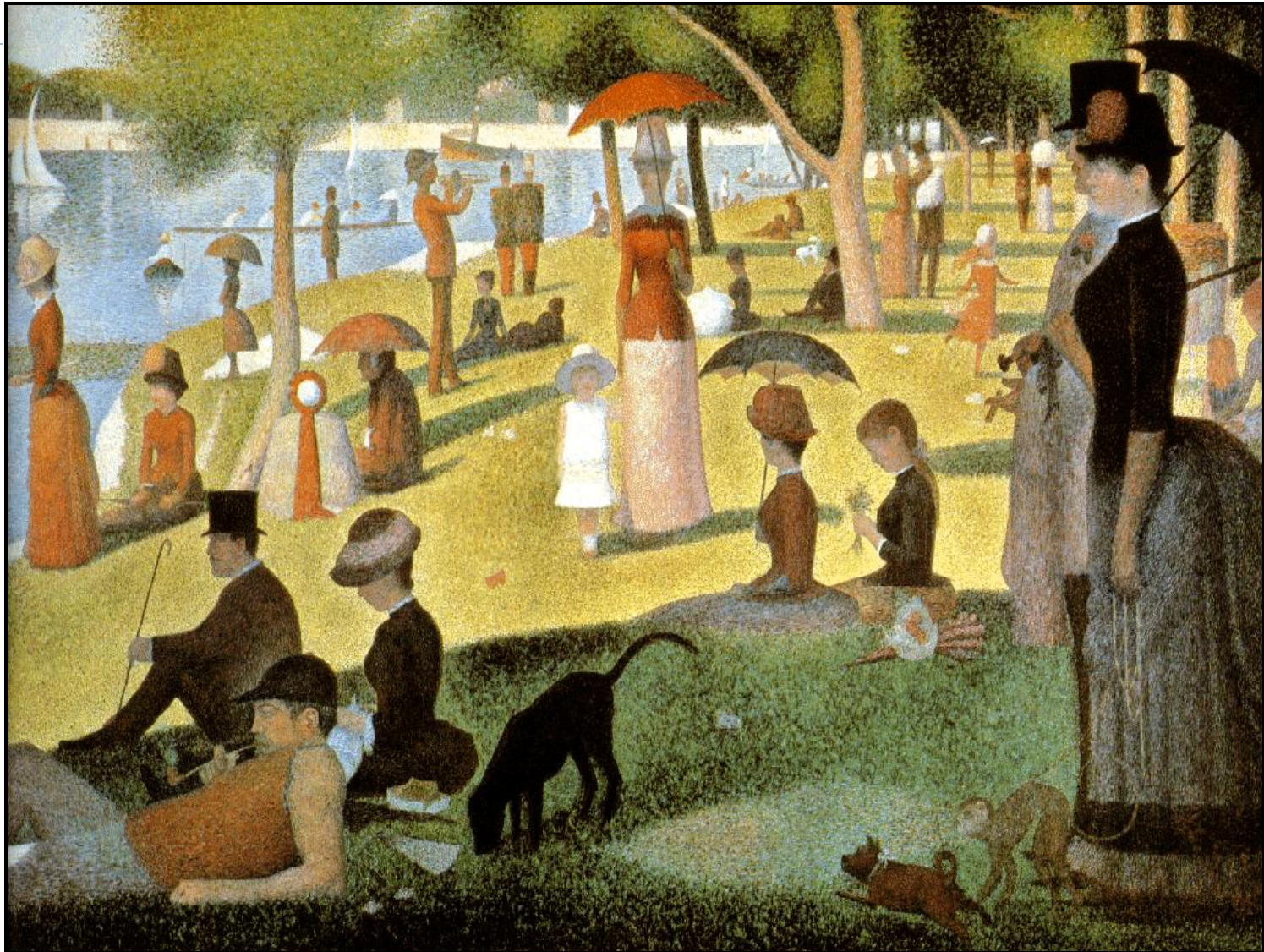
Uma Tarde de Domingo - Georges Seurat