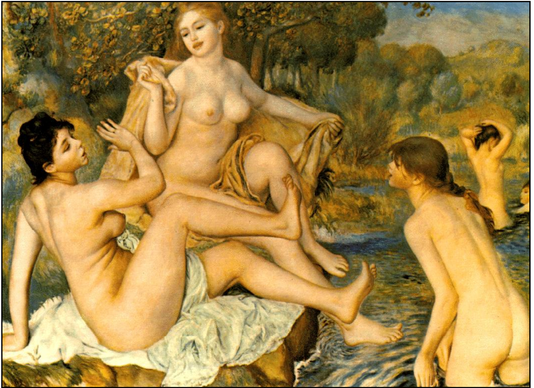
As Banhistas - Auguste Renoir (1887) Philadelphia