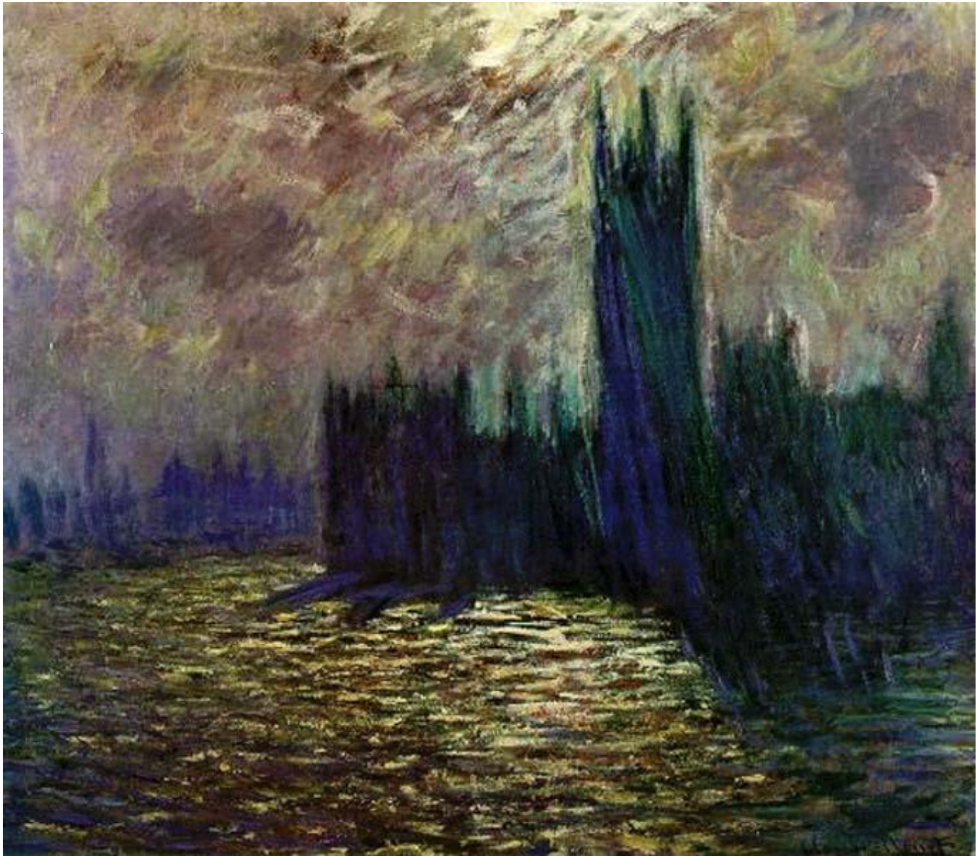
Le Parlement. Reflets sur la Tamise - London, Parliament, Reflections on the Thames (1905) Oil on canvas 81.5 × 92 cm Musée Marmottan Monet. Paris