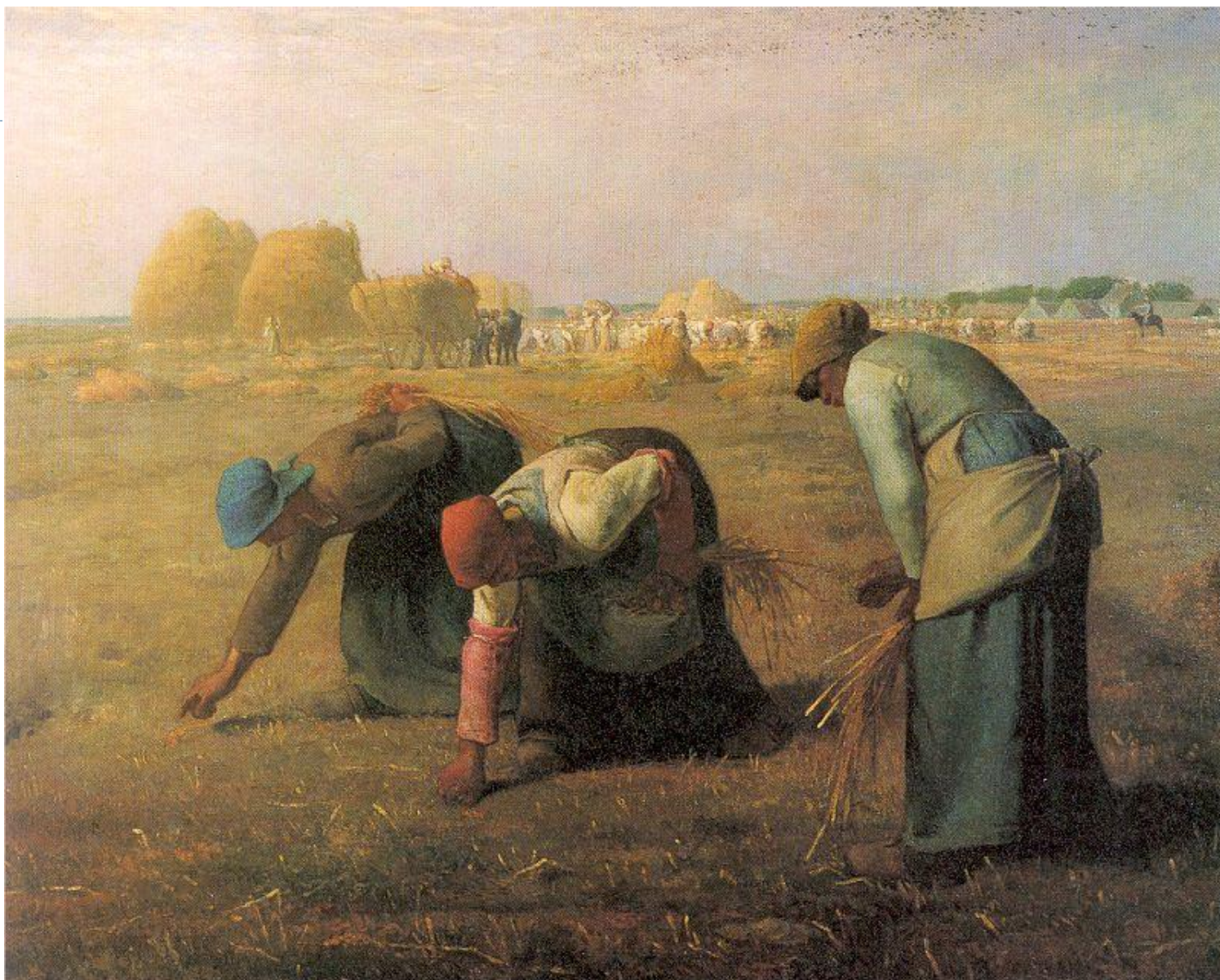
As Coletoras de Restolhos (1857) - Jean-François Millet 84 x 11 cm. Dorsay, Paris