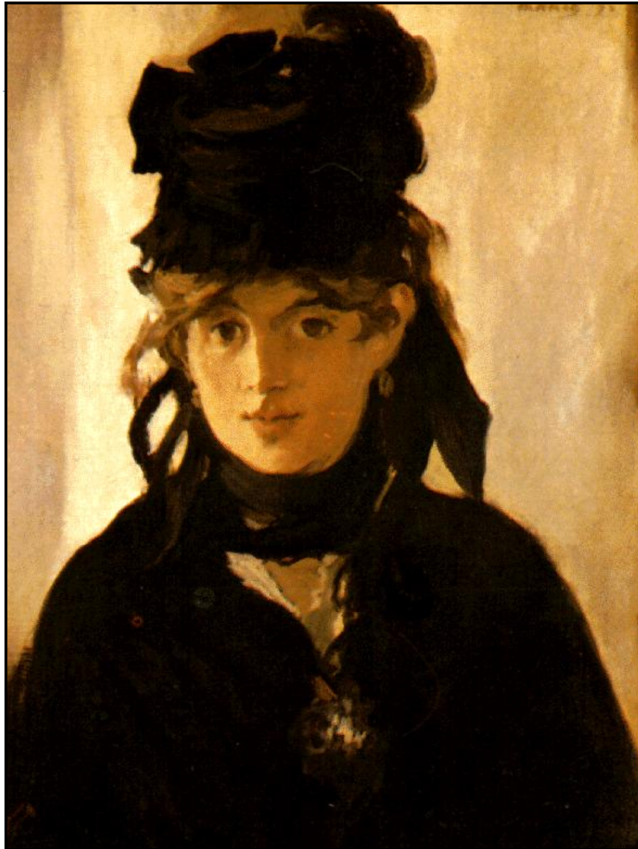
Berthe Morisot - Auguste Renoir